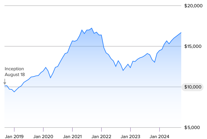
● Growth Fund

If you had invested $10,000 at inception, the graph below shows what it would be worth today, before tax.